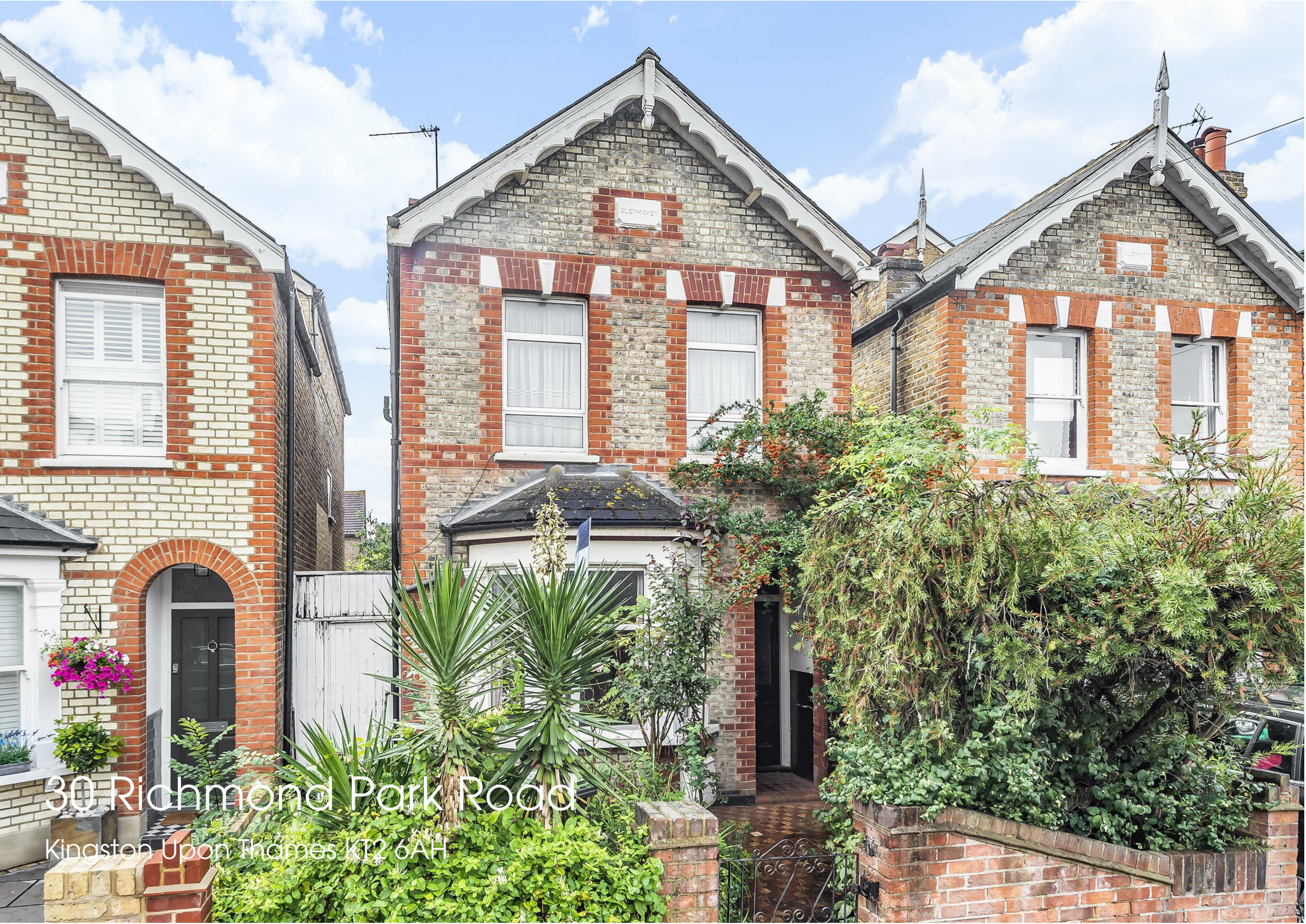
30 Richmond Park Road Kingston Upon Thames KT2 6AH